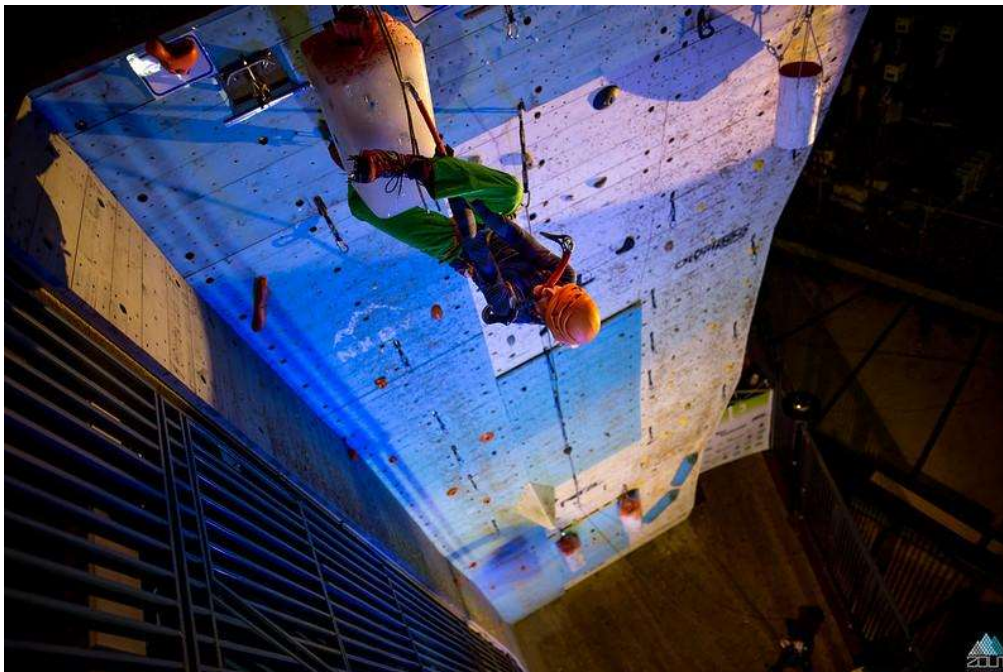
The about 14 degrees overhanging competition wall.

The competition wall is built against a solid concrete climbing wall. It gets a winter dress of wooden panels when the leaves start falling. We added a roof section for competitions. We are planning to further extend the competition wall with two extra lead lines. This will result in two competition walls with both about 15 meters height. One has about 14 degrees overhang on average. The other is on average about vertical.