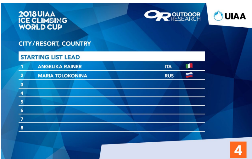
Figure 4 - Starting Lists