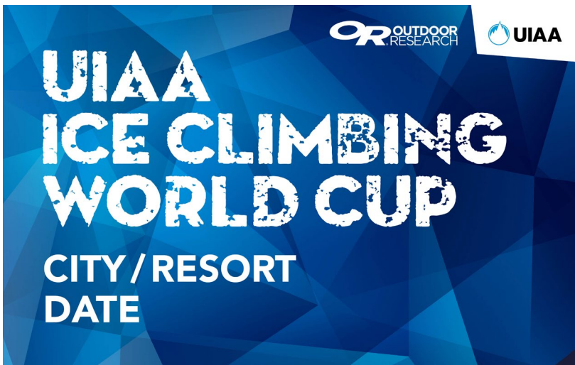
Figure 2 - Trailer

The trailer as depicted in Figure 2 shall appear: