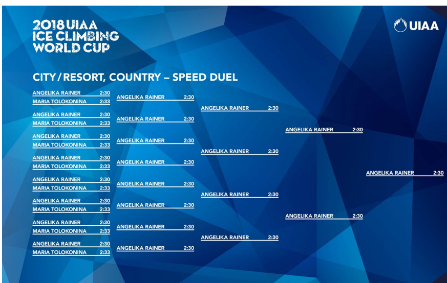
Figure 10 - Results Speed Dual Format (16 competitors)