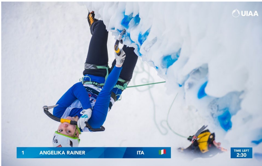
Figure 5 - Lead Competition