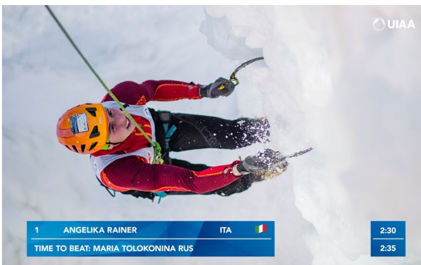
Figure 6 - Speed Single Competition

Figure 6 shows an example of the competition display during an athlete's performance in speed.