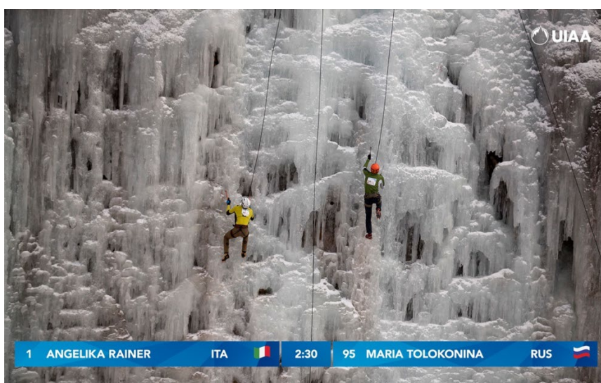
Figure 7 - Speed Dual Competition

Figure 7 shows an example of the competition display during an athlete's performance in lead.