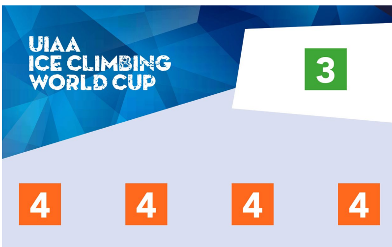
Figure 3 - Organizer's Partner Display

Figure 3 shows an example of partner display.