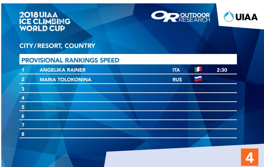
Figure 9 - Rankings Speed Single Format