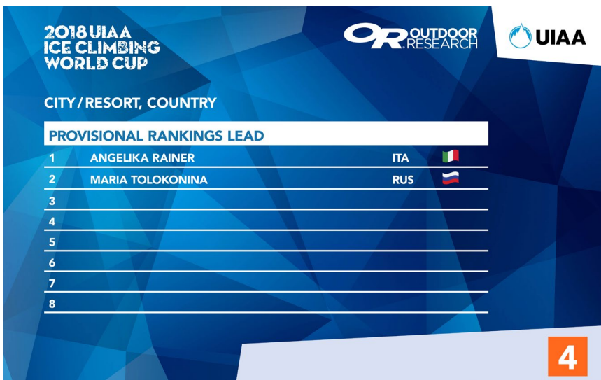
Figure 8 - Rankings Lead